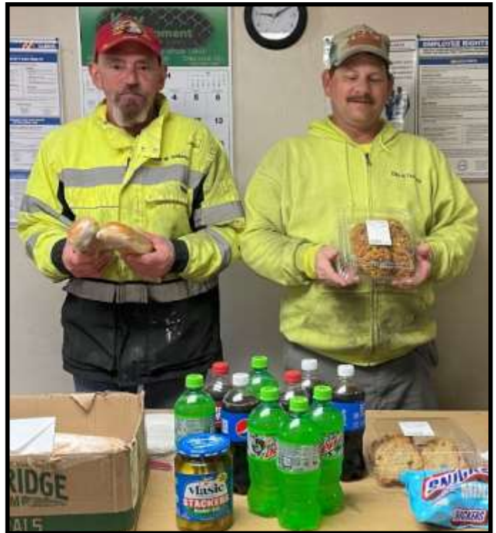
THE GOOD NEIGHBORS of Fairview Haven recently provided a meal to appreciate the City of Fairbury's street department. We're grateful for their hard work.