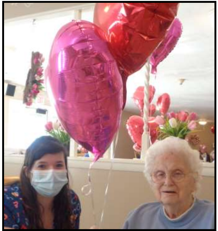
FAIRBURY residents and other customers at Family Dollar in Fairbury made donations to fill Fairview Haven with balloons for Valentine's Day.