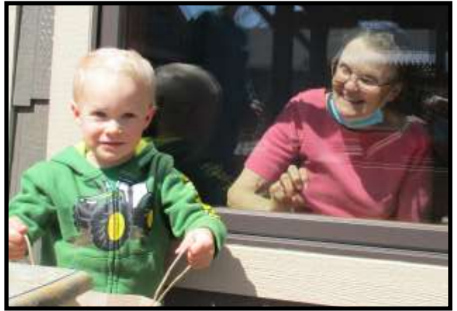
EASTER EGG HUNT in the courtyard was delightful for the grandchildren and great-grandchildren who came.